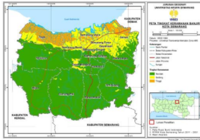
Fig 3. Flood Risk Map of Semarang City

The environmental effects of tidal flood have been affecting drinking water and sanitation systems in inundated areas. People in inundated areas experience changes in water color, taste and smell due to tidal flood. Drinking water becomes polluted and creates water-related diseases. The common effects of flooding are waste overflow, bad smell and sanitation infrastructures damage. Consequently, the environmental effects and health effects of flood are linked to each other, and the decreasing quality of water and sanitation system affects people's health conditions.