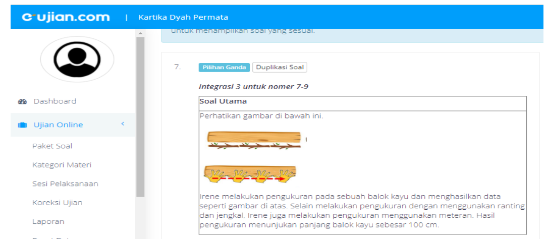
Figure 1. Improvement on the E-ujian Website

Improvements to the grid were also carried out by removing the HOTS indicator on questions with LOTS and MOTS cognitive levels. The HOTS indicator on the question was replaced with the Competency Achievement Indicator (GPA). Other improvements were also made based on the advice of the material experts. The design improvements were also carried out by improving the writing and layout of images, discourse on the main questions, supporting questions, and answer choices. Improvements to the questions on the Eujian website page can be seen in Figure 1.