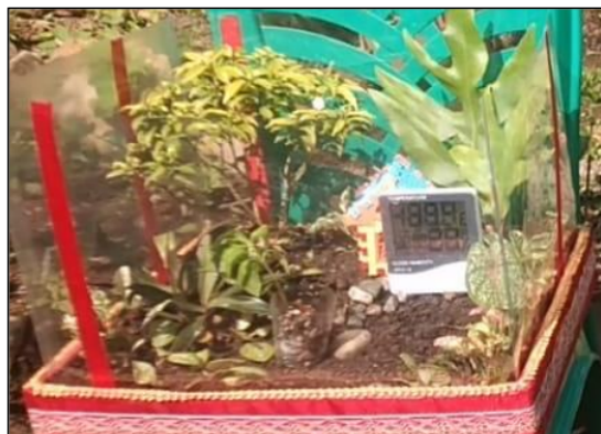
Figure 1. Simple Terrarium Media

A simple terrarium was assembled to help the teacher in describing the global warming topic of study. The media can describe the global warming concept through practicum and simulation. The results of media validation are presented in Table 5.