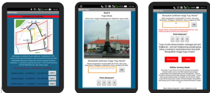
Figure 1. App interfaces