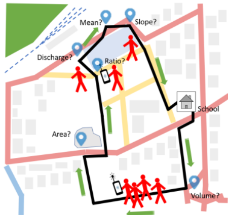
Figure 3. Illustration of the activity scenario

tasks. Some tasks and trails can be accessed by the public, and some are only accessible in private, with a special password.