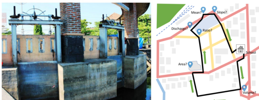
Figure 2. The task of the floodgates of Semarang Old Town in the Old Town Route

It is a native app that displays the math trail routes/map including location coordinate of the math trail tasks and user's current position and the authentic mathematical problems. The app informs them of the tools needed to solve the problems, the approximate length of the trail and the estimated duration of the journey. On the trail, the app, supported by GPS coordinates, helps the users to find the locations. Once on-site, the users can access the task, enter the answer, obtain feedback and ask for hints if needed. The app also give the brief information related to the object, such as: its history, its function, etc.