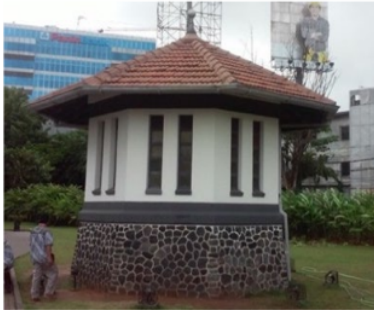
Figure 4. The Well Pump House