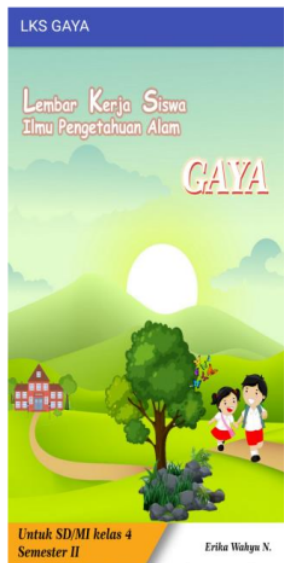
Figure 2. Menu View

learning activities in grade IV. In the android-based LKS, there are several displays, namely: (1) logo (2) cover page (3) preface (4) Basic Competencies, Core Competencies, indicator, (5) material, (6) practicum (7) about evaluation (8) glossary, (9) bibliography, (10) biography. Below is the view in LKS with android-based: Figure 1. Cover View