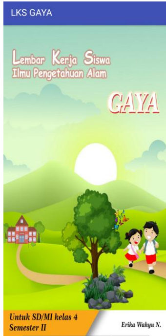
Figure 2. Menu View

learning activities in grade IV. In the android-based LKS, there are several displays, namely: (1) logo (2) cover page (3) preface (4) Basic Competencies, Core Competencies, indicator, (5) material, (6) practicum (7) about evaluation (8) glossary, (9) bibliography, (10) biography. Below is the view in LKS with android-based: Figure 1 . Cover View