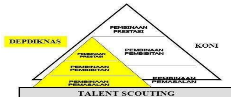
Figure 1: Pyramid of the Athlete Breeding Stage

According to Ghazali (2015), the coaching stage is divided into three levels, while the three levels can be described in a coaching pyramid, as shown below: