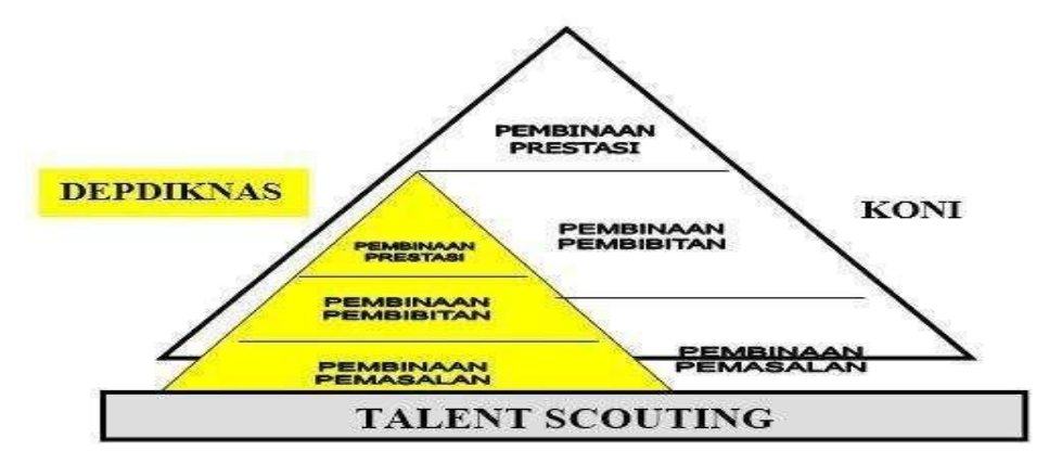
Figure 1: Pyramid of the Athlete Breeding Stage

According to Ghazali (2015), the coaching stage is divided into three levels, while the three levels can be described in a coaching pyramid, as shown below: