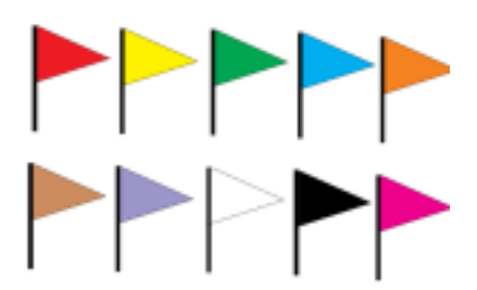
Figure 2. Game Flags