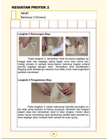
Figure 4. Manufacture of 3-Dimensional Products/Works According to Work Steps

SB dP Berkanya 3 Dimensi Langkah 4 Penyatuan Atap dan Dinding Pada langkah 4, rekasitan atap dengan merenakan garis lem di selutuh tepi atas mumb. Leakskan atap dinyan merenakan garis lem di selutuh tepi atas mumb. Leakskan atap dinyan persekal bian merenak Laksikan atap dinyan persekal bian merenak Laksikan atap dinyan merenakan merekatah bian persekal kalan juga dari merejakah sengen Ekasih gada merejakannya dari ru-men dan merekatahan biang-biang di dalam satu wama dari daga dengan wama yang berbeda dengan kuas keol.