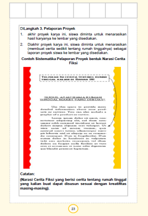
Figure 6 . Written Reporting of The Results of 3-Dimensional Products in The Form of Narratives in The Form of Fiction Related to The Work

Description of student learning activities