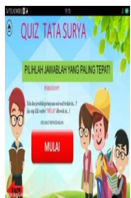
Figure 2. Appearance Planetarium Observatory Virtual