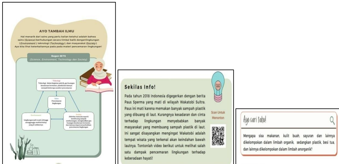
Figure 2. Additional components in the SETS-based environmental pollution module with Islamic values

Another reason that makes science material experts state that the module developed very valid is an "Ayo cari tahu" component, assignments, and exercises to train students' scientific literacy. These three things cover all aspects of scientific literacy that are assessed, so that students can train and improve their scientific literacy. The three components of this module are always present in every sub-material of environmental pollution, so that in each learning process, students can practice their scientific literacy. The study process, which held carried out while the COVID-19 pandemic, required that all learning processes be conducted online. Therefore Students work on each task in the SETS-based environmental pollution module containing Islamic values individually. In addition, the exercises in the module help students to practice their scientific literacy independently because at the end of the exercise in the module there is an answer key accompanied by an explanation and how to determine the score obtained by the students. So, these three components can certainly train and help improve students' scientific literacy.