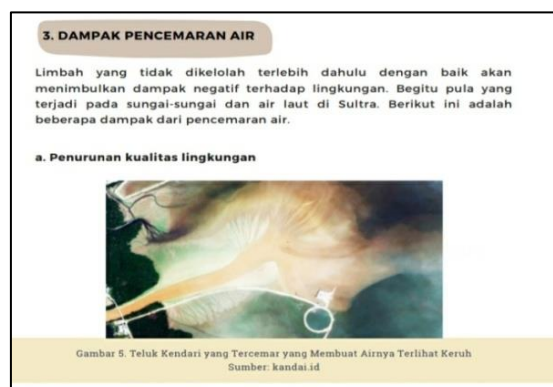
Figure 1. Module Displaying Pictures of Environmental Pollution in Kendari Bay, Southeast Sulawesi

Based on Table 2, science material experts, Islamic religious material experts, and media experts stated that the SETS vision environmental pollution module containing Islamic values was very valid for science learning. This kind of research results because the module includes basic competencies, learning objectives, table of contents, concept maps, assignments, summaries, exercises, answer keys, glossary, bibliography, and range of modules following learning objectives. In addition, the module developed also has an attractive cover that describes environmental pollution material, and the images used in the module are primarily images of environmental pollution in the Southeast Sulawesi area, one of the figures in Figure 1. The use of pollution images around the environment of students is what becomes one of the exciting factors for students in studying environmental pollution material.