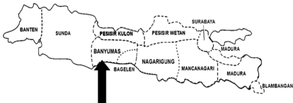
Figure 1. Banyumas Region Map of Javanese Culture of Indonesia

One of the folklores that grows and develops as an oral tradition in the community is Banyumasan, from Central Java, Indonesia. Banyumasan folklore is a cultural product that has a locality position, uniqueness in character and is typical of the character of the Banyumas region (Febriani 2018). Banyumasan folklore as a cultural text is a track record of the life of the Banyumas community, drawing the value of cablaka as a local genius of Banyumas. Cablaka and egalitarian attitudes are the cultural identities of Banyumas people. Cablaka can also be interpreted as a character of honesty that emphasises the frankness of Banyumas people. (Priyadi 2007: 13). Banyumasan folklore, which contains the core values of cablaka , such as the Tragedi Sabtu Pahing, Babad Ajibarang, Babad Jalan Pekih, Babad Baturraden, and others, still survives today.