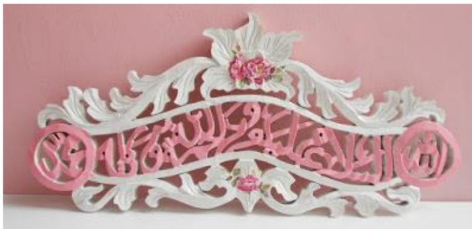
Figure 2. Naskhi -style calligraphy on stone media

Another type or style of calligraphy that is commonly found is naskhiy . There are 17 or 42.50% naskhiy style writing. Khat naskh is a form of Arabic calligraphy that resembles khat tsulust , it's just that the shape is simpler or not as complicated as khat tsulust . Khat naskh is generally used according to the name naskh or manuscript, namely writing texts or books. The main characteristic of khat naskh is a cursive form, which is a circular motion. Apart from that it is characterized by its clarity, simplicity, and ease of reading.