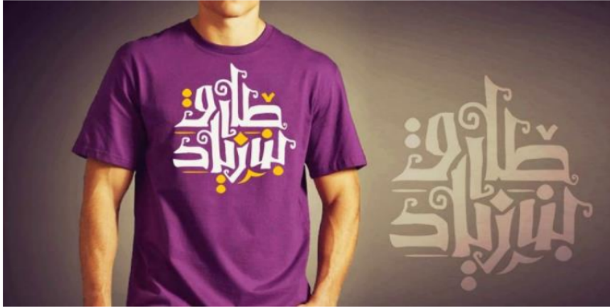
Figure 8. Pure abstraction calligraphy or fake calligraphy on t-shirt media

In addition, there are also 6 or 8.57% calligraphy expressions of pure abstraction type or fake calligraphy that cannot be read because they are a series of meaningless letters.