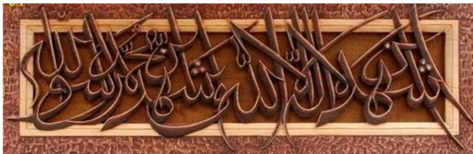
Figure 5. Contemporary non-standard calligraphy, the development of tsulust style on wood media

Apart from these styles, there are mixed styles that try to combine several types of calligraphy, such as (1) a combination of diwaniy and naskhiy styles in the expression (الله محمد); (2) a combination of diwaniy , tsulust , and naskhiy styles in the expression (الداء والدواء); (3) a combination of diwaniy and tsulust styles in the expression (الله محمد، أشهد أن لا إله إلا الله وأشهد أن محمد رسول الله) and (الله). Three forms of writing do not follow specific rules or styles so that their writing styles cannot be grouped. However, there are non-standard forms that are the development of standard formats to appear as contemporary forms, such as the three forms of development of the tsulust style.