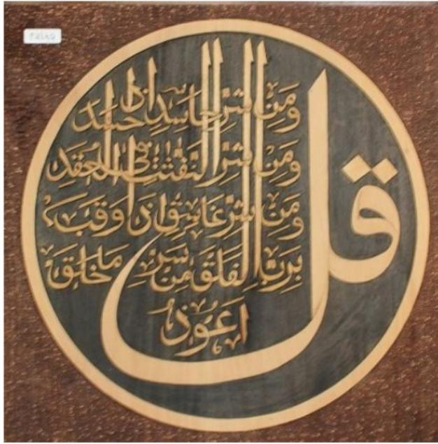
Figure 7. Expressionist calligraphy letter al Falaq on wood media

In addition, there are also 6 or 8.57% calligraphy expressions of pure abstraction type or fake calligraphy that cannot be read because they are a series of meaningless letters.