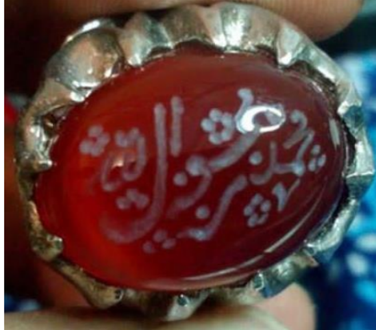
Figure 3. Calligraphy in physical style on agate media

is not the same as conspicuously, so it takes more than one pen in writing. Besides that, it has a distinctive characteristic is the number of letters that have a flowing horizontal curve and are too extended. Filling in small circles, very fragile and sharp edges of letters, emphasis on flat rather than vertical strokes, and contrasting the lines' width are also other characteristics of fa> risiy typeface.