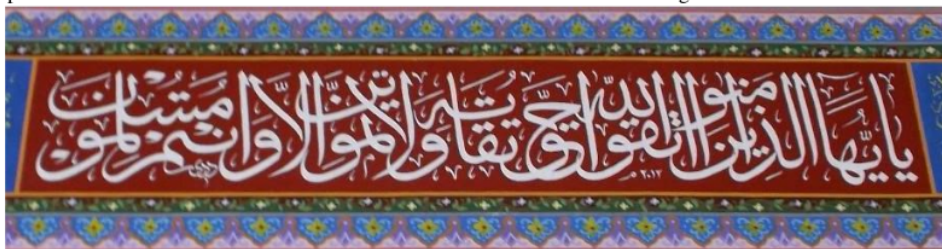
Figure 1. Tsulust -style calligraphy on wall media (graffiti)

From samples of Central Javanese calligraphy expressions, the dominant type or style used in calligraphy expressions is Tutsulusiy . There are 39 or 55.71% of the writing in tsulust style. The characteristic of khat tsulust shows flexibility which makes it easy for the letters to be lengthened or shortened to fit into the existing space or shape. Lined lines and extended vertical lines are standard features of this writing.