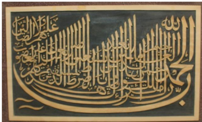
Figure 6. Figural calligraphy of the al-Fatihah letter ship on wood media

This type of traditional expression is a type of calligraphy art expression widely used by the people of Central Java. From the existing sample, there are 25 or 35.71% types of traditional calligraphy expressions. Traditional calligraphy is an example of a category that shows harmony with long-established habits and more standard elements in the Islamic tradition. Another type of expression that is just as widely used after traditional expressions is figural calligraphy expression. There are 25 or 35.71% types of figural calligraphy used by the people of Central Java. In figural calligraphy design, letters can be extended and shortened, stretched and pressed, or made transparently. This is done by lengthening, twisting, and looping or adding or filling, bringing them into harmony with the shapes of no calligraphic, geometric, plant, animal (zoomorphic), or human figures.