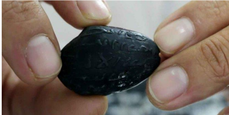
Figure 10. Symbolic calligraphy in the form of three letters (ل) and (ن) on stone media