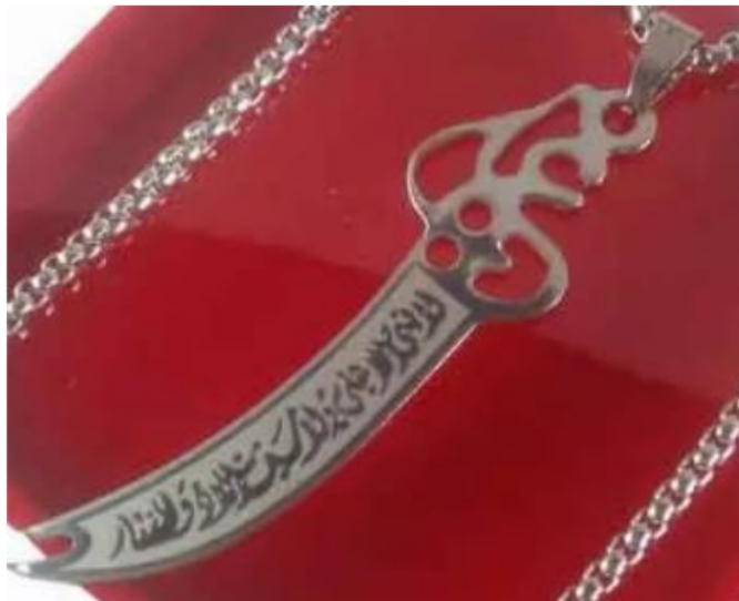
Figure 4. Diwaniy-style calligraphy on mini sword-shaped accessories

Another style that is rarely used as a form of calligraphy expression in the Central Java region is diwaniy. There are two or 2.85% diwaniy style writing. Khat diwa> niy is a form of Arabic calligraphy that also accentuates an aesthetic element by displaying curved lines. The characteristic of khat in <wa> niy is flexible arches, the posture is tilted to the left in layers with decorative patterns that show its beauty. Another feature is that the round writing is recognizable by its excessive flowing movements and the gradual elevation and lengthening of the letters at the end of the line.