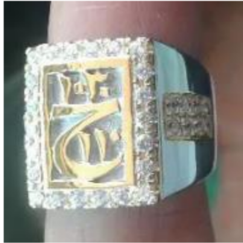
Figure 9. Symbolic calligraphy in the form of numbers (1030 above, 110 below) and letters (ح) on the media for ring accessories.