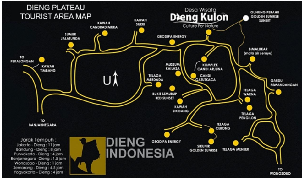
Figure 1. Tourism attraction mapping of Dieng Kulon rural tourism

From various identifications conducted through research process, the model of rural tourism development applied in Dieng Kulon that has brought success in this rural tourism can be described in Figure 2.