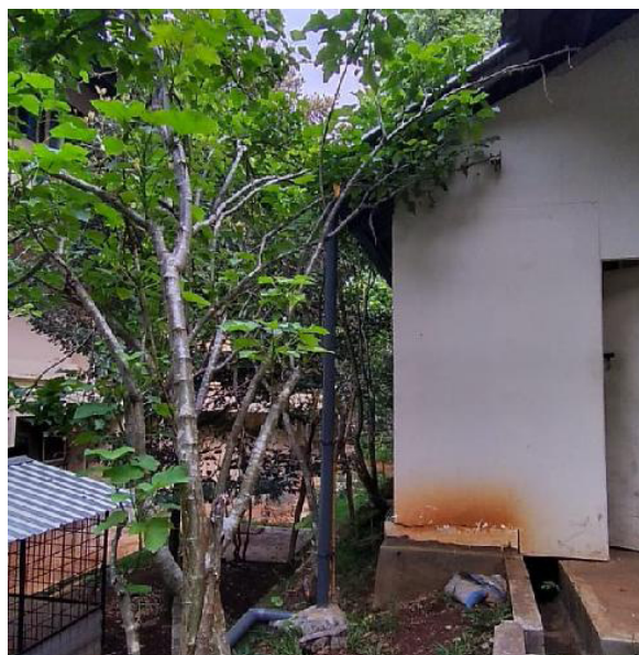
Figure 3. the rain collecting model in UNNES campus. The model was constructed to reduce the runoff effect.

UNNES campus also conducted another rain collecting model to reduce the runoff impact [11]. The model is shown in Figure 3. Briefly, the second model showed in Figure 3 was conducted by installing the fuller in the lowest part of the roof where the water is coming down. Then the pipe was installed on the edge of the fuller to transfer the water to the culvert.