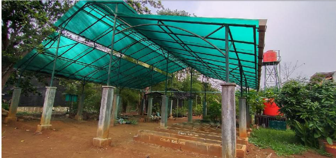
Figure 2. the rain collecting model in UNNES campus. The model was constructed to be utilized for watering purpose.

Ministry of Public Works, by improving the drainage system to reduce runoff [11]. The rain collecting model is shown in Figure 2.