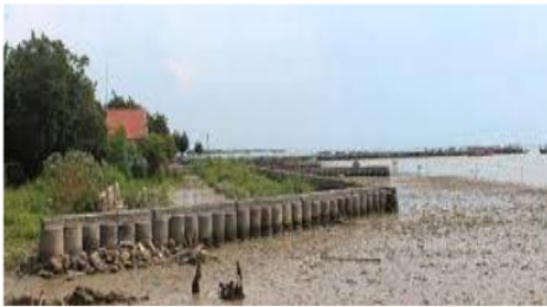
Figure 3. An abrasion resistant barrier in the form of a concrete pipe [13]

Rembang Regency, as one of the areas with a high risk of abrasion, has implemented several forms of structural mitigation. According to [13], structural abrasion barrier mitigation can be done through mechanical and vegetative means. Structural mitigation efforts are being executed by arranging limestone rocks on the coast of Rembang. Another form of abrasion barrier found in Rembang Regency is a concrete pipe. The structural method by mechanical means of this concrete pipe model is rarely used in other areas in Indonesia because, in general, concrete pipes function as culverts in residential areas. Installation of concrete pipes is done by digging a little (> 50 cm) of soil in the coastal area and planting concrete pipes in the excavated hole. The hollow concrete pipe is filled with soil which functions as a load so that the waves do not easily knock it over. Concrete pipes are usually installed in areas that have a typology of muddy beaches. The description of concrete pipes in Rembang Regency can be seen in Figure 3.