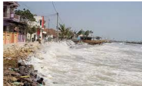
Figure 2. The condition of eroded beach is called beach erosion or abrasion

Various attempts were made to resist the waves of seawater. A temporary effort was made by piling sandbags on the beach along a residential area. Moreover, the government is seeking funds for long-term management to save the residential environment of residents. Local fishers are worried that if embankments are made, they cannot moor their boat. Therefore, it is necessary to make a suitable coastal embankment to moor their boats.