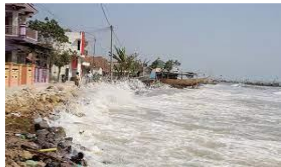
Figure. 2. The condition of eroded beach is called beach erosion or abrasion

Various attempts were made to resist the waves of seawater. A temporary effort was made by piling sandbags on the beach along a residential area. Moreover, the government is seeking funds for long-term management to save the residential environment of residents. Local fishers are worried that if embankments are made, they cannot moor their boat. Therefore, it is necessary to make a suitable coastal embankment to moor their boats.