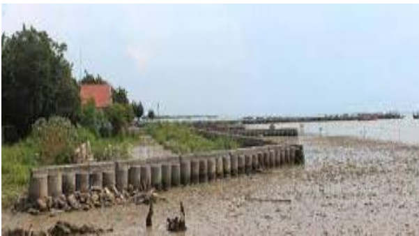
Figure 3. An abrasion resistant barrier in the form of a concrete pipe [13]

Rembang Regency, as one of the areas with a high risk of abrasion, has implemented several forms of structural mitigation. According to [13], structural abrasion barrier mitigation can be done through mechanical and vegetative means. Structural mitigation efforts are being executed by arranging limestone rocks on the coast of Rembang. Another form of abrasion barrier found in Rembang Regency is a concrete pipe. The structural method by mechanical means of this concrete pipe model is rarely used in other areas in Indonesia because, in general, concrete pipes function as culverts in residential areas. Installation of concrete pipes is done by digging a little (> 50 cm) of soil in the coastal area and planting concrete pipes in the excavated hole. The hollow concrete pipe is filled with soil which functions as a load so that the waves do not easily knock it over. Concrete pipes are usually installed in areas that have a typology of muddy beaches. The description of concrete pipes in Rembang Regency can be seen in Figure 3.