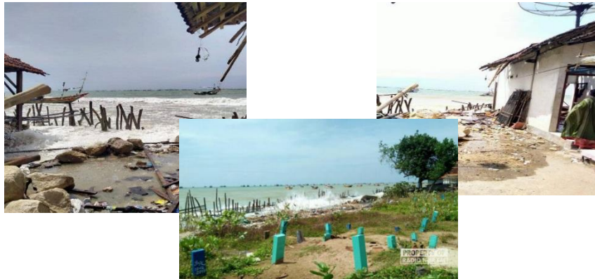
farmers. Residents along the coastal area of View to abrasion.

Village in Kragan Subdistrict cannot sleep soundly every time the eastern climate arrives. The waves usually occur from day to night time. At night, seawater rises to the ground, crashing and scavenging the field and waterways. Not only the house but several graves in the public cemetery area of Karangharjo Village, Kragan Subdistrict, Rembang City, were damaged by being hit by big waves so that the condition of the graves were getting worse, some were even missing due to the onslaught of the waves, resulting in abrasion. Figure 1 showed the damage to houses and graves due