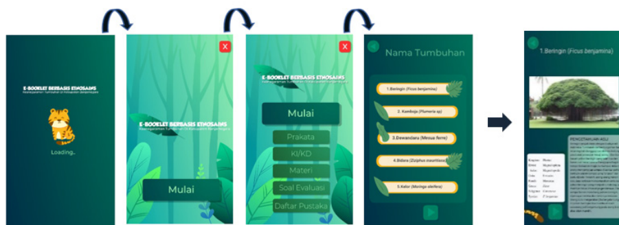
Figure 2. Examples of e-bokartumbuhan Media Components at the Beginning Section

are designed in such a way, to attract students' attention and interest in learning. Another learning media is e-bokartumbuhan, which can be illustrated by Figures 2 and 3.