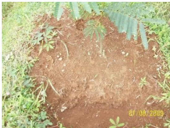
Fig. 2. Landslide events encountered during the field observation