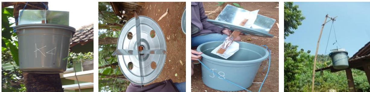
Figure 1. O. rhinoceros beetle trap device contains the aggregation pheromone

The aggregation pheromone used is made by the Medan Palm Oil Research Center/Pusat Penelitian Kelapa Sawit (PPKS) Medan. It contains Ethyl 4 methyl octanoate compounds. This compound is an aggregation pheromone that attracts both male and female O. rhinoceros . Liquid pheromones were packaged in porous plastic packaging which can efficiently be used for approximately three months. Pheromones were placed in 10 L bucket traps with 35 cm in diameter and 40 cm high (Figure 1). Pheromones are hung inside the bucket. In the bottom of the bucket, there was sawdust and a hole for water discharge when it rains. The top of the bucket was covered with a hole with 5 cm in diameter for the entry of the beetle into the bucket. Rectangular zinc was placed at the top of the bucket to direct the beetles that come in to get into the bucket through the hole.