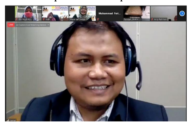
Figure 3. Socialization Participants Listen to Material Exposure