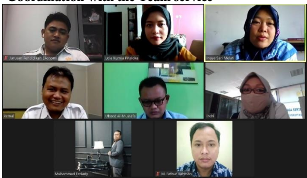
Figure 1. Coordination with the Team service

The result of coordination activities is that the event is carried out through from within the network / online this event is conducted because the current conditions are still in the pandemic corona / covid - 19 where the government prohibits to hold events that invite crowds, therefore, the event we play 3600 with all events we set online from all events this devotional activity.