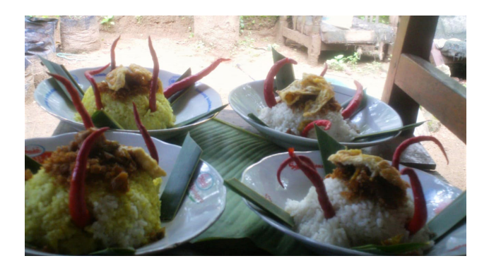
Figure 9. Asahan.

The other side dishes are served jenggareng , (black soybeans, peanuts, and beans). Besides that, there are tempe goreng , gereh petek goreng , srundeng ,