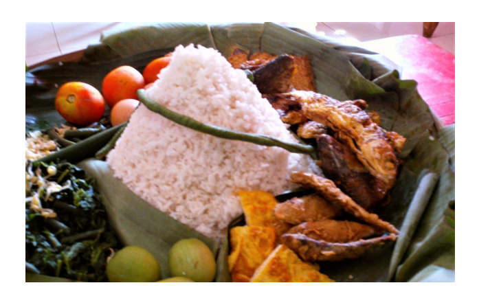
Figure 6. Tumpeng Marga Pakewuh.

Having tumpeng obor/oncor in a death memorial or salvation ceremony as a symbol of the request to obtain pepadhang could also be an explanation for the inclusion of Islamic elements in Javanese culture. Tumpeng oncor is a symbol of lighting. When a person starts to enter the grave, the body would face a new nature. Here, yen padang dudu padange awan yen peteng dudu petenge wengi means that bright is not bright of the day, and dark is not dark of the night. That is nature's grave. Feelings of dark and bright depend on the deeds a person has done in the world.