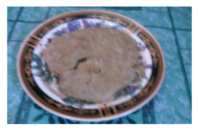
Figure 10. Jenang Sepuh.

Respect for parents or elders could also be seen from the level of speech in the use of the Javanese language. In the levels of formality in the Javanese the language, aside from the level ngoko , there is also level called karma , which is also used to talk to people who are older than the speaker. According to Bastomi (1995: 46–47), in the view of Javanese people, parents, elderly