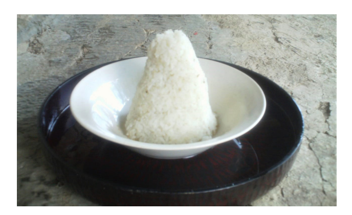
Figure 4. Tumpeng Gung.

As described in the sub-section on the meaning, the Javanese believe that, for people who die on an even day, the salvation offerings need to be supplemented with tumpeng gung. This is in accordance with the calculation of "gunung-guntur-segara-asat," (i.e., if the calculation results in an even number, it means guntur 'thunder' and asat 'drought', so special offerings need to be made to avoid danger and a lack of fortune). Hence, the serving of tumpeng gung is related to the hope that wong sing ditinggal aja asat rezekine means that the people left behind would not lack of fortune, so their fortune would always be agung, which means abundant.