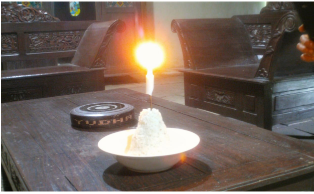
Figure 7. Tumpeng Obor.