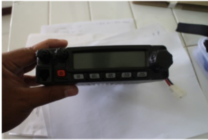
Figure 4 Radio receiver Yaetsu FT-1802 M/E

The next step was to coordinate the member of team researchers, also with LIPI and RCS (Raptor Conservation Society) to conduct stabilization team through theoretical training and simulation in the Semarang State University area (Figure 5), Mangkang Zoo, and then directly in the field study on Mount Ungaran.