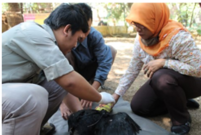
Figure 5 To setting radio transmitter on backpack

Trial installation of the transmitter have been done on Wreathed Hornbill species in Mangkang Zoo. We decide to put the transmitter placed in the backpack of the bird for one week by using the jacket coat (Figure 5 and 6).