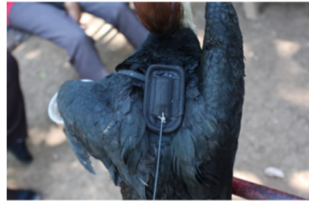
Figure 6 Radio telemetri backpack attachment method

The test results showed that a transmitter attachment on the backpack has a strong resistance. So that even the birds had several times tried to pull, strong enough transmitter attached and not damaged. After one week simulation, originally a bird disturbed so that it always seeks probe backs and wings to try to take it off, but the next day had not demonstrated such behavior.