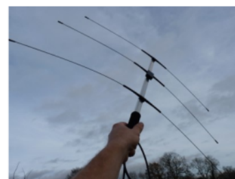
Figure 3 Antenna Yagi 151 MHz

The antennas type that we used also Whip type, while receivers are used Yaetsu mkl the FT 690 mhz frequency 150000-151999 MHz (Figure 3 and 4).