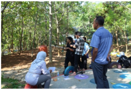
Figure 5 Simulation radio transmitter in SSU

The next step was to coordinate the member of team researchers, also with LIPI and RCS (Raptor Conservation Society) to conduct stabilization team through theoretical training and simulation in the Semarang State University area (Figure 5), Mangkang Zoo, and then directly in the field study on Mount Ungaran.