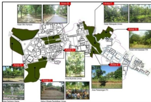
Figure 2 UNNES forest campus map distribution [14]

Based on current conditions, UNNES campus forest is not sufficient to absorb CO 2 emissions. Campus forest that should be provided by UNNES is an area of 14.25 Ha whereas the state of the available field campus forest is 13.103 ha.