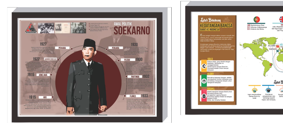
Figure 2: Sample of infographic product.

Sixth, learning videos, and documentary films, and profiles, are audiovisual learning media that serve as media for learning history. The aim is to increase student motivation in learning history. Historiographies made with the help of this program include the infographics of characters and events as shown below.