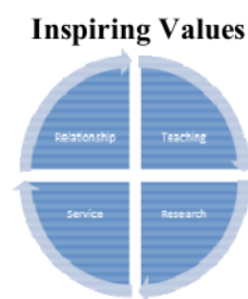
Figure 1. Inspiring Value

Hence, according to the research findings, the most prominent aspect among four activities in implementing the inspiring values is the aspect of relationship building. While the lowest score obtained from researches. If we sort the activities based on the highest score, the list would go on as relationship building, lectures, social services, and researches. The list is demonstrated in the pie chart below.