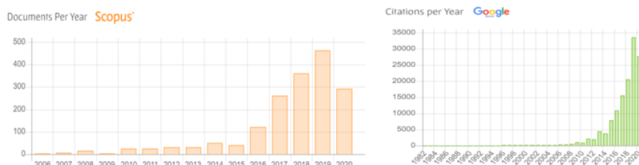
Fig. 1 Data of Publication from UNNES, Indonesia

Both Indonesia and Malaysia are from the same region of Asia continent, which is in Southeast Asia. They have similar culture, language, race and majority religion. The regulations issue, particularly for the education sector during the pandemic has also high similarities. During the pandemic, the research performance of faculty members is declining. Universitas Negeri Semarang is one of the public higher education institutions in Indonesia. The faculty members have publications in reputable and indexed journals yearly. However, there has been a decrease from 462 research articles in 2019 to only 291 research articles in 2020. The citations number also dropped from 33 530 to 27 721 from 2019 and 2020 respectively.