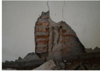
FIGURE 1. Some failure of beam and wall in Domestic Welfare Science Home Economics Department, Universitas Negeri Semarang