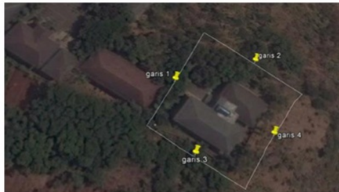
FIGURE 2. The location of landslide study on Universitas Negeri Semarang area

The study was conducted on a slope on the side of the E9 Building, Domestic Welfare Science Department, Universitas Negeri Semarang, Semarang. The location is situated at 7^{\circ} 39,31'' South and 110^{\circ} 4'13,15'' East and at an altitude of \pm 300 m. The topography and the slope in study area could can be seen in Fig. 3 and average of slope angle is 56^{\circ} . The type of soil is predominantly clay and precipitation based on the data from Indonesian Agency for Meteorology, Climatology, and Geophysics (BMKG) is 101-150 cm/h. The area which was used as the object of research was 400 \text{ m}^2 .