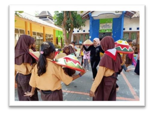
Figure 6. Students' Moves

The result of observing dances is then practiced together with other students. Each student is able to practice the moves based on the observation, both from pictures and videos. Students are able to create dance aesthetics, composition of works, and creating the beauty of property, make-up, costumes with very good results. It can be seen that students are able to show aesthetic moves using power technique based on the needs and theme. The moves found and practices are varied, including the counting, power, and feeling in the moves. The variety of moves in counting is counting one to eight produces 1 move, counting one to eight produces 2 moves, counting one to eight produces 5 moves, counting one to eight produces 5 moves, counting one to eight produces 6 moves. The moves implement dance characteristics such as wiraga , wirama and wirasa . The students' moves can be seen in the following figure.