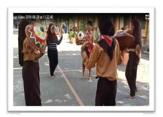
Figure 9. Moves creativity

Students' creativity can be built well, this can be seen from their development since the very first step of simple moves of body parts such as leg, hands, body, and head. Moreover, the moves are developed and practiced further. The moves are practiced in place then in another place. Furthermore, the students are filling the space including the direction, tempo, level (high-low), and rhythm. The second one is through music stimulation which is responded by creative moves.