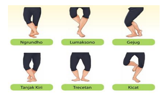
Figure 3. Leg moves