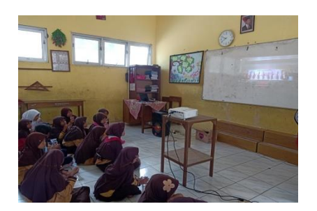
Figure 5. Students do observation

The activity of students' observation is presented in the following picture.