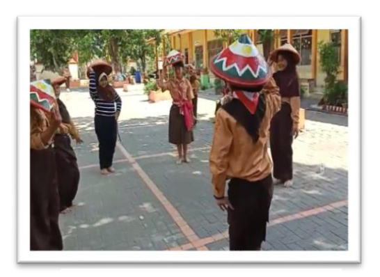
Figure 8. Moves construction

The body parts that students move look aesthetic and attractive. During the activities of dance learning, students set moves, arrange moves, and combine moves into a set of moves in harmony with the supporting elements of dance performance.