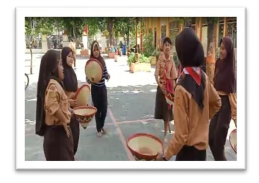
Figure 7. Dance Exploration

Students are able to develop the existing moves into a variety of moves. Basic moves are developed into various moves. All moves are varied through energy changes, for example, sharp or soft, strong or weak. The moves are explored into tight or loose moves, free flow or balanced. Students are able to make changes in moves with various dynamics.