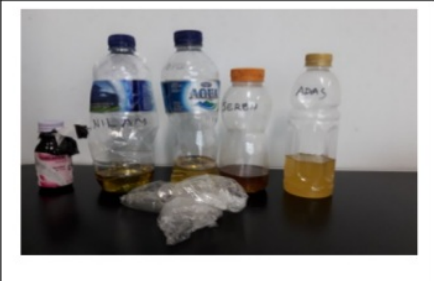
Figure 1. Photographs of research locations, resource persons, and essential oil products