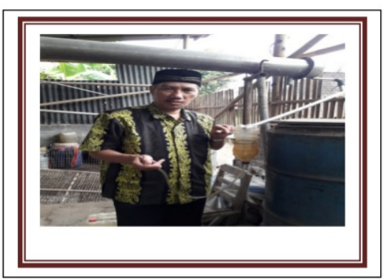
Figure 2. Photo documents for distillation equipment and essential oil products

In this study all documents, data from observations and interviews with owners and employees of oil refiners in Boyolali, Certial Java, Indonesia, were then analyzed according to STEM aspects. The results of the research show that the techniques, methods and methods of refining essential oils are still the same as how the ancestors used to distill essential oils. Knowledge of essential oil refining technology obtained only based on its ancestors is known as ethnechnology [8, 9]. The results of the analysis of various literature and interviews with essential oils are also known that people use essential oils mostly as perfume, medicine, and use them to use them on the surface of the body/skin. Utilization of plants that contain essential oils as medicine. The resource person had the correct knowledge in producing essential oil product sharing, which in the distillation process contained the concept of isolation, identification, secondary metabolite compounds, and essential oil organoleptic test [2].