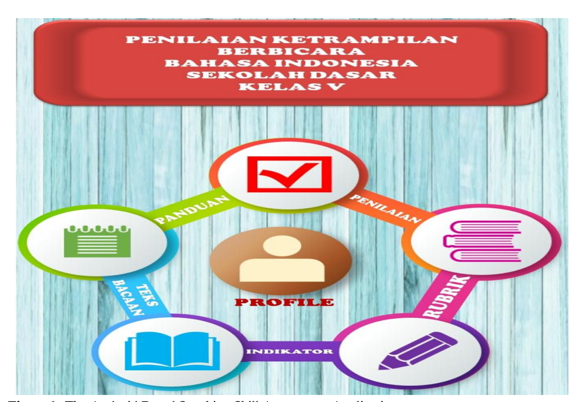
Figure 1. The Android Based Speaking Skill Assessment Application

The use assessment instrument on paper is not efficient. Thus, there is a need to develop android based speaking skill assessment by using smartphone.