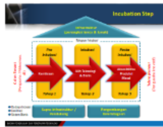
Figure 1. Entrepreneurship Incubation Step

Model in entrepreneurship training that developed by Dikti is called INWUB ( Inkubasi Wirausaha Baru ) or incubation for new entrepreneur (Kementerian KUKM 2012) xvii . The training has three steps, that are Preparation, Implementation, Finalization. It can be drawn below: