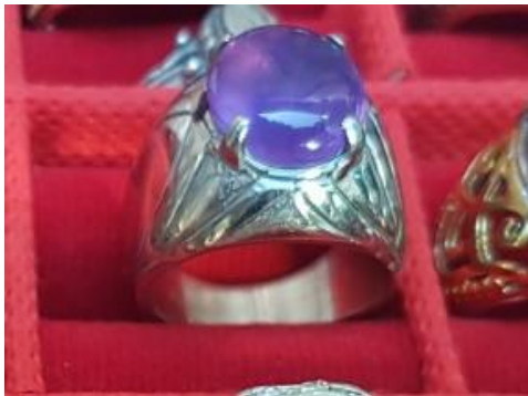
Figure 2 Polished Java Amethyst

The definition of Geographical Indications according to Article 1 paragraph (6) of Law Number 20 Year 2016 concerning Trademarks and Geographical Indications is: