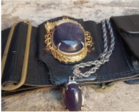
Figure 1 Polished Javanese Amethyst