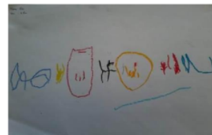
Figure 7. Alvis (4 years)