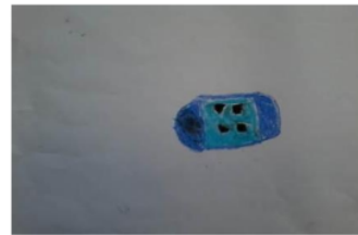
Figure 6. Alvaro (6 years)