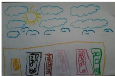
Figure 3. Adinda (6 years)