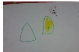
Figure 9. Vallen (3 years)