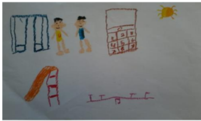
Figure 1. Hana (7 years)