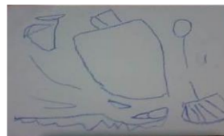
Figure 8. Hani (3 years)