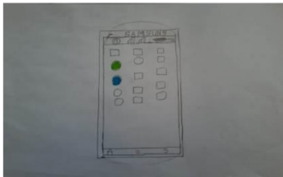
Figure 2. Naura (7 years)