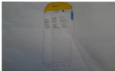
Figure 4. Kirana (6 years)