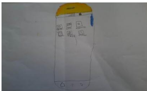
Figure 4. Kirana (6 years)