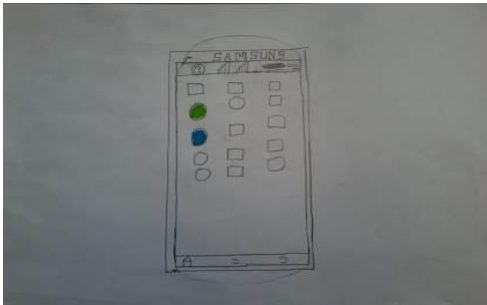
Figure 2. Naura (7 years)