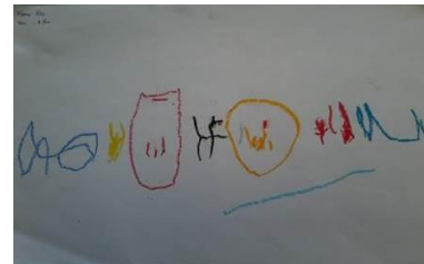
Figure 7. Alvis (4 years)