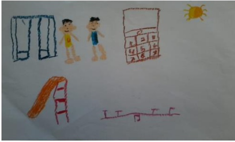
Figure 1. Hana (7 years)