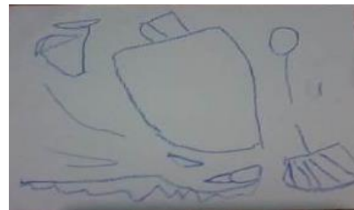
Figure 8. Hani (3 years)