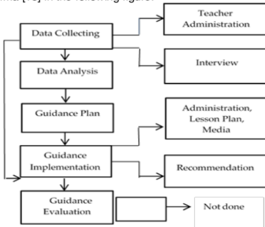
Fig. 1. Flow of Teacher Competency Development by the Principal