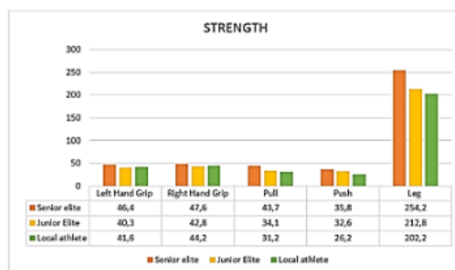
Figure 1. The graphic showed the strength of left-hand grip, right-hand grip, pull upper arm, push upper arm and leg

Muscle strength static was measured by a dynamometer. Senior elites showed the highest scores in left and right-hand grip, pull, push and leg strength test. The junior elite showed the lowest strength of the right-hand and left-hand grip, while junior elite showed the lowest in the pull, push and leg strength test. (Figure 1).