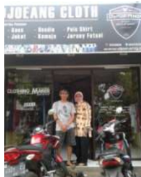
Picture 9 Outlet of Djoeng Cloth

Unsec Bakery also has a rapid growth in terms of their products and marketing strategy. Unsec Bakery played an important role in Semarang State University 50th anniversary celebration by making a giant cake shaped Semarang State University emblem. Because of the event people acknowledged the existence of this bakery and gave a high appreciation for the creativity. Now the market for their products become larger and larger as their products have been highly varied.