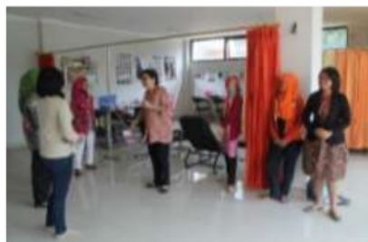
Picture 6 "Chiby Salon" in Unsec's 2 nd floor

Galery Unsec room in the third floor is used for education, training and assistancy programs. All of IbK assistancy program are centered in this floor with enough room for twenty tenants or more. Education and Training Room for enterprising is also provided with wi-fi and internet access. It is located in central parking area for scholars, lecturers and workers to ease the access to every faculty and working unit in UNNES. IbK program through the education activity educates scholar entrepreneurs to have basic knowledge and enterprising spirit. The training are conveyed classically according to the program IbK team has provided (arranging installment proposal training) or according to what tenants need when running the project, such as creating committee training.