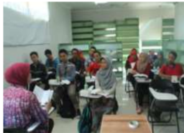
Picture 4 Classical Mentoring for Developing Tenants' Business Plan

Bussiness plan was practiced by the tenants to count the financial need especially for enlarging or adding omzet. Through financial loan without interest which was given by IbK team, tenants learned to manage their project finance. The income they got in every transaction was saved. After a month, it was used to pay the loan back gradually. The lesson of paying in installment was to teach tenants to keep the commitments and promises and to be loyal to the agreement. In this step, tenants had started up their new project with assistancy facility. The assistancy enveloped expert consultation in terms of management, marketing, production, or technology to help opening access to the market, financial resources, also to help giving alternative solution to the problems.