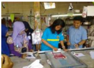
Picture 3 Training for t-shirt screen printing in convection business

Some SMEs that had been visited for IbK program located in many places of Central Java, such as candle craft business and paper waste craft business in Boyolali, convection business and yoghurt business in Ungaran, and so forth.