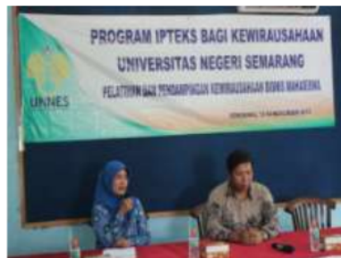
Picture 2 Entrepreneurship and Education Training for Students

Entrepreneurship education was given to IbK tenants by giving the motivation from the motivators, entrepreneurs, and lecturers. Entrepreneurship education generally gave knowledge to students who are interested in enterprising especially IbK tenants, and have strong faith in enterprising. Entrepreneurship class were conveyed mechanically by motivators with real examples. This was aimed to give motivation to the tenants that a business needs believing in success, businessman is born to be wealthy and able to make family and his workers prosperous.