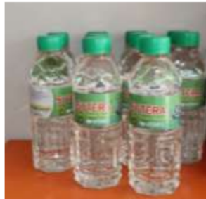
Picture 8 CC-Oxy bottled drinking water with zero TDS

The most outstanding product in 2013 is CC-Oxy bottled drinking water. This product has been clinically proven to have zero Total Dissolved Solid (TDS) levels. TDS is the total amount of dissolved solids in water. The solids can be minerals such as iron, chloride, and others. WHO standard for drinking water purity is limited to the value of TDS 40 ppm. More than that the rest of the process can not be extracted from the body to remove it. The risk settles in vital organs that can cause various diseases. Therefore, drinking water with zero TDS is able to maintain and parse sediment in the vital organs. Now, CC-Oxy onlycan be found in Unsec gallery. But tenants has built a new marketing planning to explore the new market for this product.