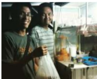
Picture 7 Kyuubi Yoghurt chooses outdoor concept for their business

Beside indoor business, many tenants run their businesses outdoor of Unsec building. Lately, even most of the tenants business is an outdoor business which are run at strategic locations around UNNES. In 2013, there were 7 of 20 tenants business run their business in outdoor concepts. In the second year this amount increased, 10 of 20 tenants business were outdoor businesses. In 2015, 13 of 20 tenants business were outdoor businesses. Outdoor businesses has an advantage which is less capital because tenants do not need to rent a building to run their business. All they need are just a food vending cart and a location to settle which has low-cost rent rate.