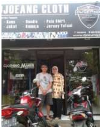
Picture 9 Outlet of Djoeng Cloth

Unsec Bakery also has a rapid growth in terms of their products and marketing strategy. Unsec Bakery played an important role in Semarang State University 50th anniversary celebration by making a giant cake shaped Semarang State University emblem. Because of the event people acknowledged the existence of this bakery and gave a high appreciation for the creativity. Now the market for their products become larger and larger as their products have been highly varied.