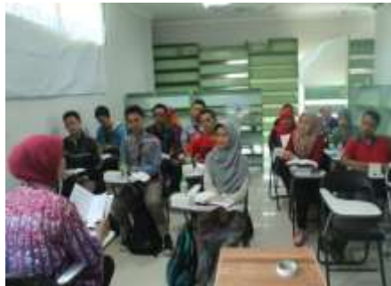
Picture 4 Classical Mentoring for Developing Tenants' Business Plan

Business plan was practiced by the tenants to count the financial need especially for enlarging or adding omzet. Through financial loan without interest which was given by IbK team, tenants learned to manage their project finance. The income they got in every transaction was saved. After a month, it was used to pay the loan back gradually. The lesson of paying in installment was to teach tenants to keep the commitments and promises and to be loyal to the agreement. In this step, tenants had started up their new project with assistancy facility. The assistancy enveloped expert consultation in terms of management, marketing, production, or technology to help opening access to the market, financial resources, also to help giving alternative solution to the problems.