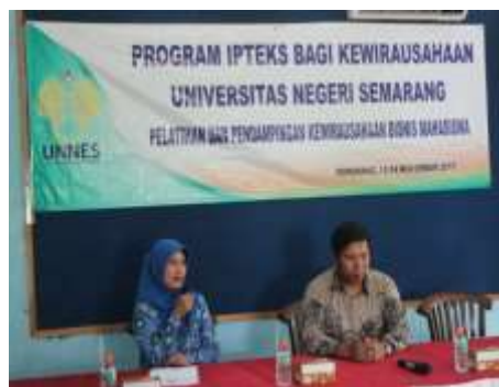
Picture 2 Entrepreneurship and Education Training for Students

tenants that a business needs believing in success, businessman is born to be wealthy and able to make family and his workers prosperous.