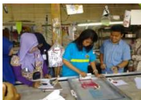
Picture 3 Training for t-shirt screen printing in convection business

Some SMEs that had been visited for IbK program located in many places of Central Java, such as candle craft business and paper waste craft business in Boyolali, convection business and yoghurt business in Ungaran, and so forth.