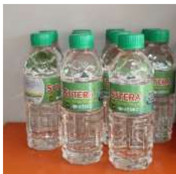
Picture 8 CC-Oxy bottled drinking water with zero TDS

The most outstanding product in 2013 is CC-Oxy bottled drinking water. This product has been clinically proven to have zero Total Dissolved Solid (TDS) levels. TDS is the total amount of dissolved solids in water. The solids can be minerals such as iron, chloride, and others. WHO standard for drinking water purity is limited to the value of TDS 40 ppm. More than that the rest of the process can not be extracted from the body to remove it. The risk settles in vital organs that can cause various diseases. Therefore, drinking water with zero TDS is able to maintain and parse sediment in the vital organs. Now, CC-Oxy onlycan be found in Unsec gallery. But tenants has built a new marketing planning to explore the new market for this product.