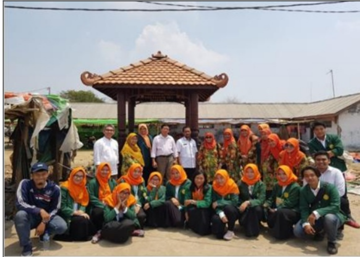
Figure 3. E-Conosmart 2.0 Socialization Team

In addition to outreach to high school and campus schools, the results of this research were socialized in the Community Service in the "Jembatan Cinta" Mangrove Tourism Area in Taruma Jaya District, North Bekasi. Community Service is carried out involving the community and students in providing education, and giving up space for General Education in the form of a Gazebo that is named 'General Education'. This is a picture showing the activity.