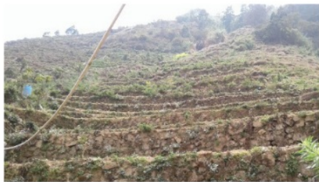
Figure 1. Condition of Terrace, Galengan using Stones in Sembungan Village

Sembungan Village area is mostly potato farming land. The land stretches from residential areas to the hilltop areas. Farmers in the village built galengan to strengthen their land. The galengan was strengthened using stones or grasses. Up to now, conservation activity was conducted by building galengan /terrace in sloping areas. The galengan /terrace is a compulsion for their land (Figure 1).