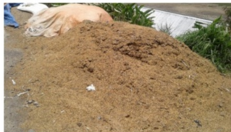
Figure 3. The Use of Manure for Potato Farming Land

Farmers used manure as a fertilizer for their land. It was assumed that manure did not accelerate soil damage, which was a contrast to chemical fertilizers. The manure was usually mixed with husks (Figure 2).