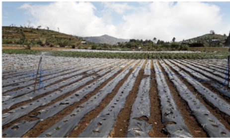
Figure 4. Without Galengan in Dieng Kulon low land area

The farmers preferred to not make galengan or terrace for agricultural land located in flat areas. The making of galengan was also supported by plants or grass used as a reinforcement (Figure 4).