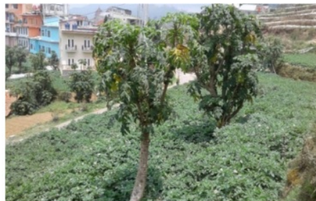
Figure 2. Tamarillo and Carica among potato crops

Farmers used manure as a fertilizer for their land. It was assumed that manure did not accelerate soil damage, which was a contrast to chemical fertilizers. The manure was usually mixed with husks (Figure 2).