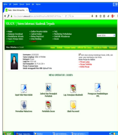
Fig 2. Lecturer Menu in Sikadu

Integrated Academic Information System (SIKADU) Semarang State University is a web based information system that is built with the aim of organizing the academic data in a University/College online [2]. The data organizing management system shall include the registration and scheduling system of lectures, management Study Plan Card (KRS), monitoring the course, organizing student grades, graduation registration handling and much more. SIKADU can be accessed online through the Internet in accordance with pages that have been determined by each institution education providers. As an example of a lecturer menu and student menu in SIKADU can be seen in Fig. 2 and 3 below.