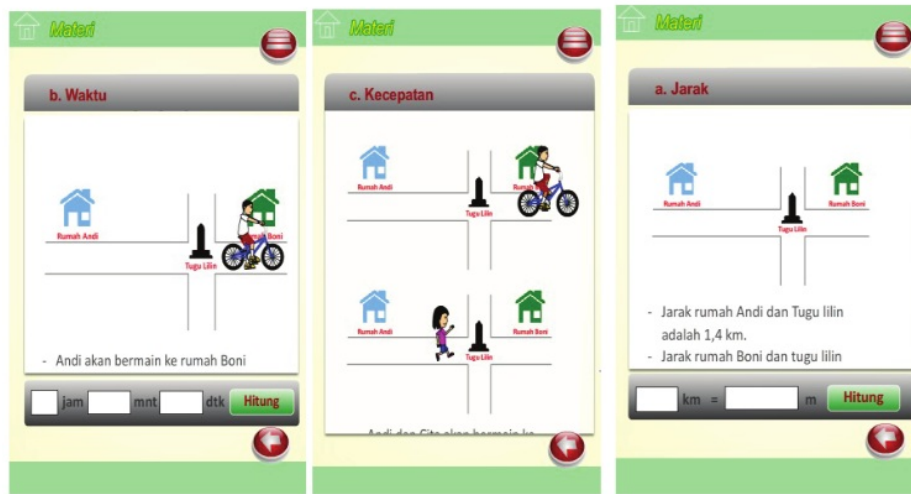
Figure 4: The content part of media, it contains the materials about distance, time and speed.