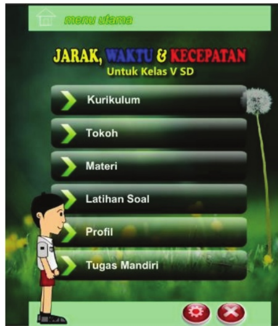
Figure 2: Main Menu.