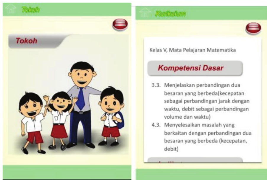
Figure 3: Opening part, the content of curriculum and the introduction of main characters of the story in MLM media.