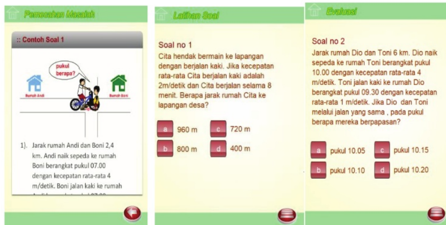
Figure 5: The Evaluation part. It is divided into three parts, the exercise, problem solving, and evaluation.

The scoring from the expert of media and the expert of children psychology upon the media developed is presented in the Table 2 .