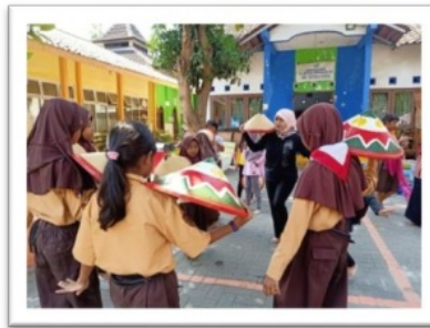
Figure 6. Students' Moves

The result of observing dances is then practiced together with other students. Each student is able to practice the moves based on the observation, both from pictures and videos. Students are able to create dance aesthetics, composition of works, and creating the beauty of property, make-up, costumes with very good results. It can be seen that students are able to show aesthetic moves using power technique based on the needs and theme. The moves found and practices are varied, including the counting, power, and feeling in the moves. The variety of moves in counting is counting one to eight produces 1 move, counting one to eight produces 2 moves, counting one to eight produces 3 moves, counting one to eight produces 5 moves, counting one to eight produces 5 moves, counting one to eight produces 6 moves. The moves implement dance characteristics such as wiraga , wirama and wirasa . The students' moves can be seen in the following figure.