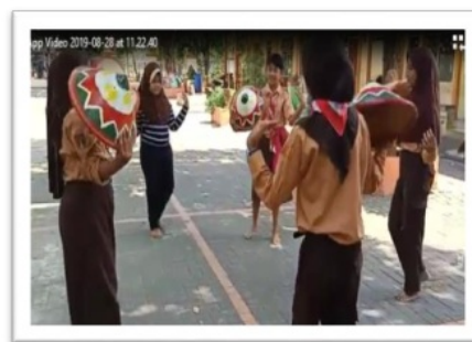
Figure 9. Moves creativity

Students' creativity can be built well, this can be seen from their development since the very first step of simple moves of body parts such as leg, hands, body, and head. Moreover, the moves are developed and practiced further. The moves are practiced in place then in another place. Furthermore, the students are filling the space including the direction, tempo, level (high-low), and rhythm. The second one is through music stimulation which is responded by creative moves.