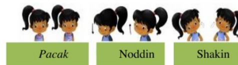
Figure 1. Head moves

Head and neck move in dance are such as pacak gulu , nodding, and shaking. The moves are presented in the following figure.