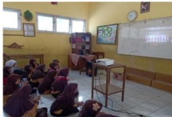
Figure 5. Students do observation

The activity of students' observation is presented in the following picture.