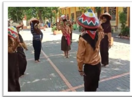
Figure 8. Moves construction

The body parts that students move look aesthetic and attractive. During the activities of dance learning, students set moves, arrange moves, and combine moves into a set of moves in harmony with the supporting elements of dance performance.