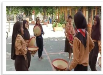
Figure 7. Dance Exploration

Students are able to develop the existing moves into a variety of moves. Basic moves are developed into various moves. All moves are varied through energy changes, for example, sharp or soft, strong or weak. The moves are explored into tight or loose moves, free flow or balanced. Students are able to make changes in moves with various dynamics.