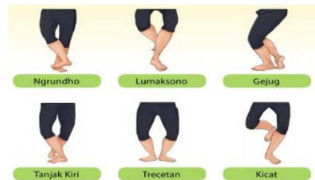
Figure 3. Leg moves