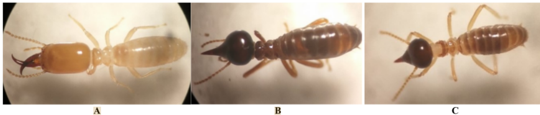
Figure 1. Morphology of termites found in Gunung Meja Nature Tourism Park Manokwari West Papua: A. Microcerotermes , B. Longipeditermes , and C. Bulbitermes ; 40 × 10 magnification

Microcerotermes spp. generally nest in trees, but close to the ground. The termites cause damage to the trees in which they nest because they eat wood of living or dead trees. Microcerotermes spp. usually nest on the main stem of a tree. Nest material is a mixture of chewed wood and dirt (Nandika et al. 2015).