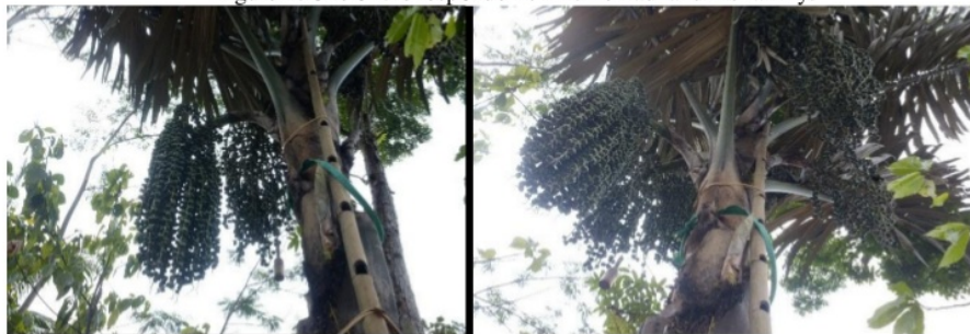
Figure 2. Palm Trees which grow much in Leban Village