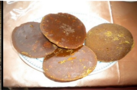
Figure 5. Produced molded-sugar

The result of society original science exploration about palm sugar production that has been reconstructed into scientific knowledge can be seen on Table. 1