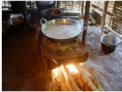
Figure 3. Nira Heating Process,