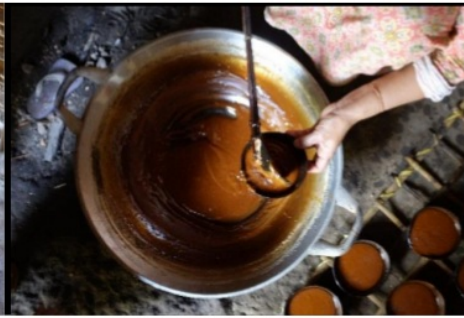
Figure 4. Molding Process