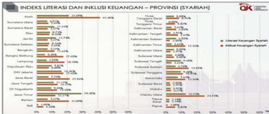
Figure 1: Financial literacy and inclusion index - Province (Islamic)

literacy is a process to increase one understands of financial concepts through various information or advice and economic activities every day.