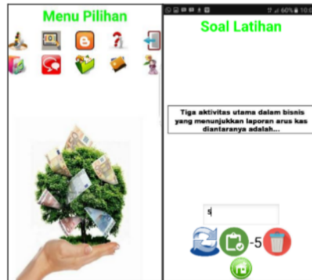
Fig. 4 Use of Android Platform to Create Mobile Application

devices. Kardoyo et al. [7] found that the use of m-learning intentions for FE students are very high. Fig. 4 shows, an example of android-based application that has been developed by FE UNNES lecturers. Many of the features that can be presented in android based mobile application, namely the provision of material (PowerPoint, video, and music), chat and discussion, quizzes, and more. Students have also successfully developed a mobile application for learning economics and accounting.