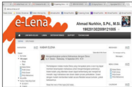
Fig. 3 Use of E-lena for Economics Learning

Some FE UNNES lecturers also take advantage of e-learning features that have been provided by the university, namely e-lena. E-lena UNNES using LMS (learning management system) based MOODLE and has existed since 2013. E-lena used by FE UNNES lecturers to integrate classroom learning in real and virtual classroom. Through features available on the E-lena, faculty can conduct lectures activities online, including uploading course materials, chat and discussion, assignments, providing an online quiz, and test (exam). E-lena is not too popular with the majority of FE UNNES lecturers because it is quite difficult to use.